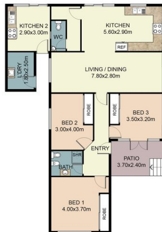
F L O O R P L A N